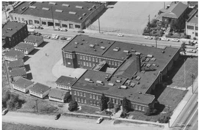
Gatzert, 1960 SPSA 226-8

Under the 1978 desegregation plan, Gatzert was linked with Day and Whittier and operated as a K–2 school. Gatzert was closed in 1984 when the district ruled the old building vulnerable to earthquake damage. Beginning in September 1984, Gatzert K–2 classes met in a wing of Washington Middle School. The Denise Louie Early Childhood Education Center, a private program that had operated at Gatzert since