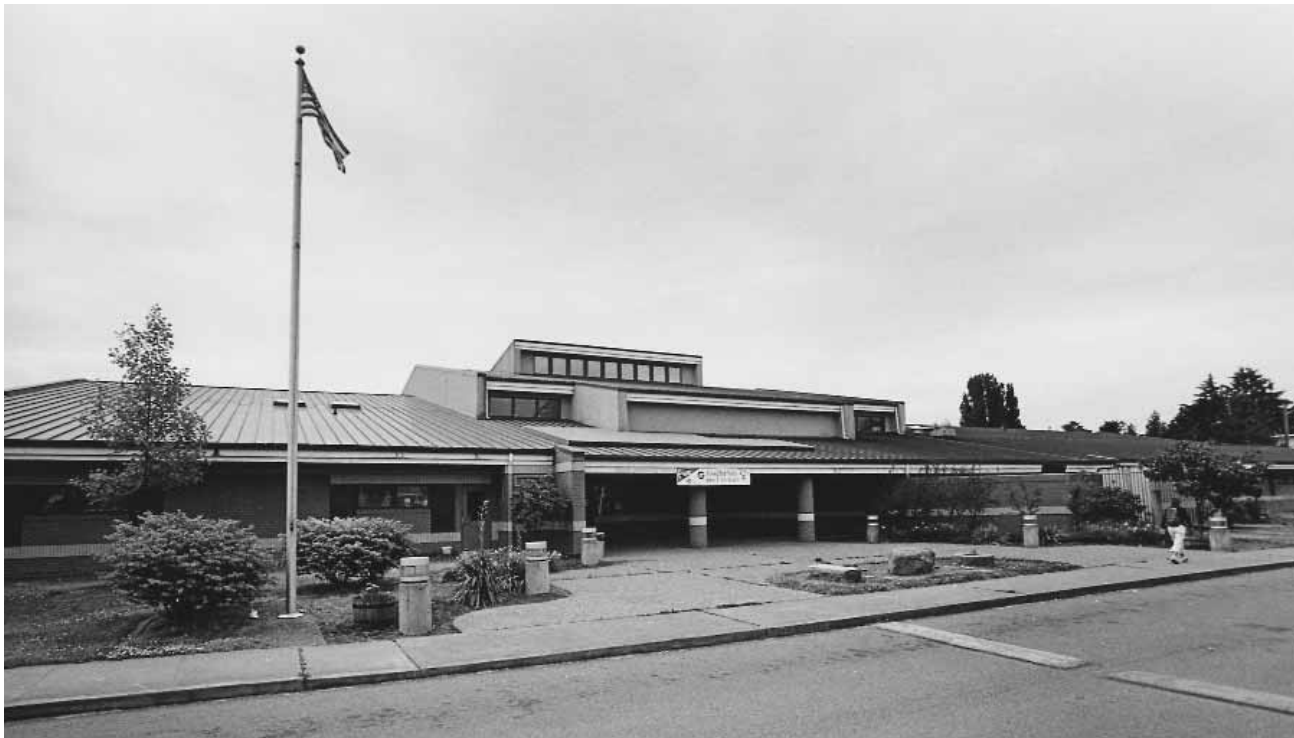
Gatzert, 2000 ©Mary Randlett SPSA 226-18

South School opened to handle overcrowded conditions in the early years of the Seattle Public Schools. For a short time, Seattle's only public school was Central I. By December 1871, that school was overcrowded, so space was rented in the Fischer Building for an annex (see Central I). The following September, two new schools opened to hold primary students, while senior and intermediate students went to Central. Primary students north of Cherry went to North School, while those south of Cherry Street went to South School.