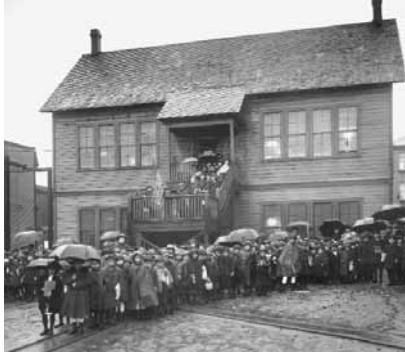
Main Street School, 1921

Name: Main Street Annex Location: 307 6th Avenue Building: Wood Architect: n.a.